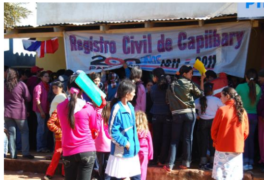
Civil Registry: Capiibary