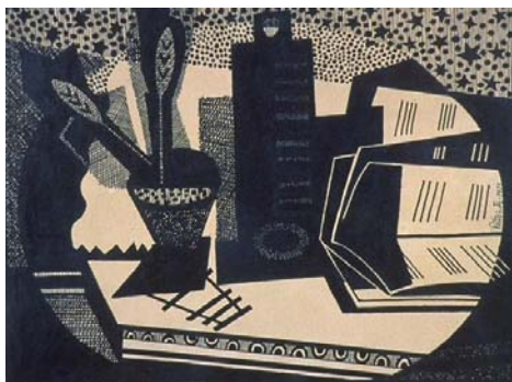
Emilio Pettoruti • Argentina La Plata, Argentina, 1892–Paris, France, 1971 Cuadernos de música (Music Notebooks) , 1919 ink on paper; 7½ x 9½ inches Inter-American Development Bank Art Collection