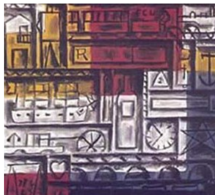
Joaquín Torres García • Uruguay Montevideo, Uruguay, 1874–Montevideo, Uruguay, 1949 Composición constructivista ( Constructivist Composition ), 1943 oil on canvas; 26 x 30 inches OAS Art Museum of the Americas, Gift of Nelson Rockefeller, 1963