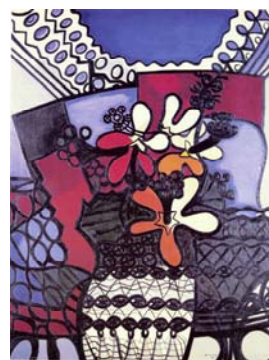
Amelia Peláez • Cuba Yaguajay, Cuba, 1896–Havana, Cuba, 1968 Marpacífico (Hibiscus [Marpacífico is the name used in Cuba for the Hibiscus flower]) , 1943 oil on canvas; 45 ½ x 35 inches OAS Art Museum of the Americas, Gift of IBM, 1969