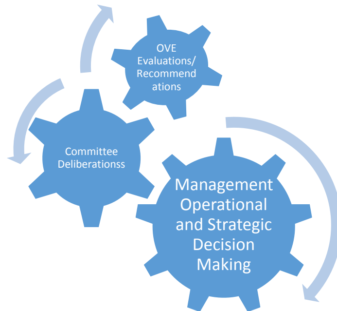
Figure 3: Organizational Learning Wheels.

87. Use of OVE's Annual Report. The annual report by OVE provides an opportunity to step back from individual evaluations and assess the broader impact of OVE, as well as provide the Board members with an assessment of the implementation of recommendations. It is in particular an opportunity to distill lessons that may not have emerged from an individual evaluation, but have been persistent across evaluations or over a prolonged period of time. In that sense, while the Annual Report typically limits itself to OVE's work during a given fiscal year, when it comes to contributing to the learning gears, OVE should not be constrained in reaching across multiple years if doing so serves to illuminate operational and organizational strengths and weaknesses.