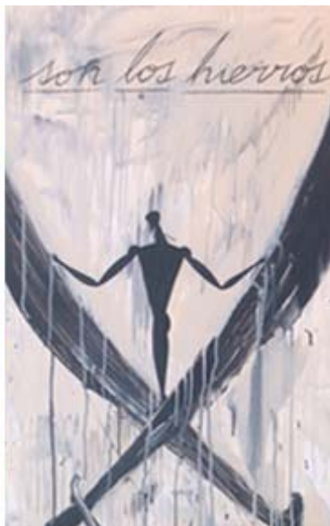
José Bedia b. Havana, Cuba, 1959 - Son los hierros (Irons), 1994 [detail] Private Collection New York City