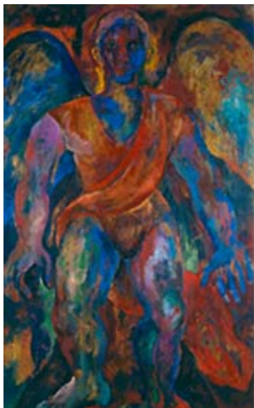
Lorenzo Jaramillo b. Colombia, 1955 - d. 1992 Ángel (Angel) , 1987 Collection of the Banco de la República de Colombia, Santafé de Bogotá, Colombia