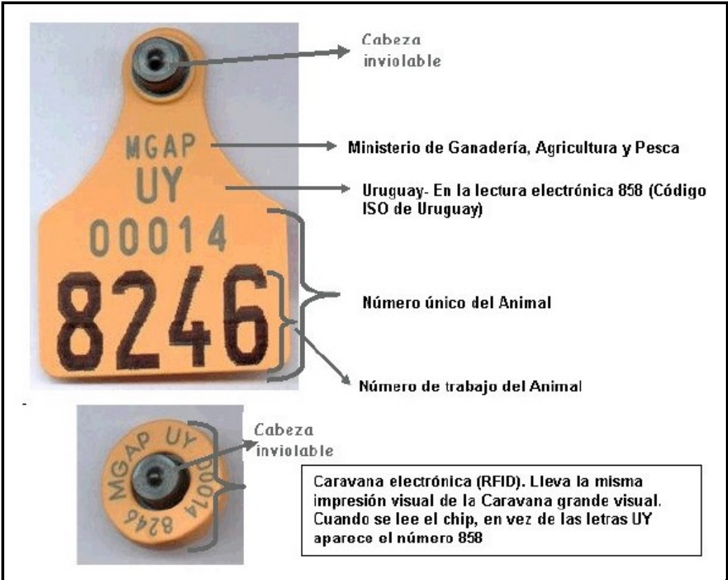
Figure 2: Solving the government’s problems?

After negotiations, it was decided that transponder devices were going to be distributed by the government at no cost to the producer, marking the triumph of the “public goods” discourse. The fact that the traceability policy followed the FMD outbreak reinforced the view among producers and market analysts that traceability was mainly a government’s response to a health threat which is normally a government’s responsibility under the public good framework.