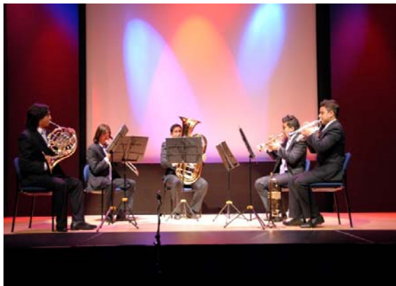
Brass Quintet of Medellin, from the University of Antioquia.

The Cultural Center actively participated in the celebration of the 50th Anniversary of the IDB in 2009, and the 50th Annual Meeting of Governors in Medellin, Colombia, by organizing a successful set of cultural events that generated local, national, and international attention. Anniversary events included a traveling art exhibition to Medellin with artworks owned by the IDB; several lectures and films, and a special