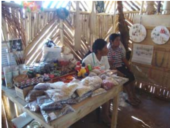
Grants 2009. In Puntarenas, Costa Rica, training in indigenous craft making and marketing by the Bribri community.