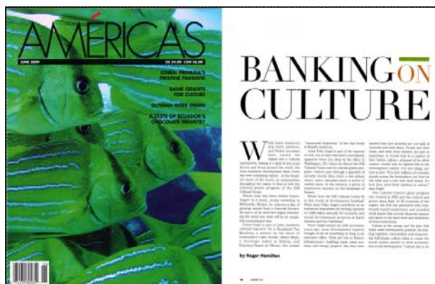
June 2009. Américas Magazine , by the OAS, published an article entitled "Banking on Culture." Through its small grants program, the IDB Cultural Center's investments in the Americas will yield immeasurable returns.

partnered with 31 institutions in 23 countries, granting financial assistance to implement cultural projects with social and economic impact. 190 project applications were short-listed by the Country Offices from a total of 896 received. A Committee carefully evaluated each proposal according to the following criteria: project viability, need, educational and formative content, location, reasonable utilization of resources, and their long-term impact on a wide sector of the community. The US$190,000 CDP fund financed diverse cultural initiatives to directly benefit 650 community members and indirectly reached 1,500 beneficiaries.