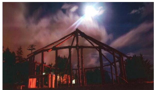
Grants 2009. Construction of indigenous-style (Muísca) building for learning by the Boyacá University, Colombia.

Tierra Sin Mal Intercultural Project , art and education in the high risk community of Barrio Sajonia of Asuncion