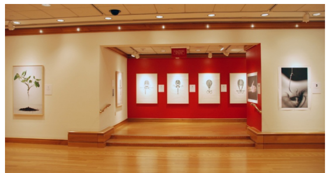
View of the IDB Cultural Center exhibition: “Being Elsewhere. Seven Artists from the Latin American and Caribbean Diaspora in Canada.”

show gathered 50 artworks (paintings, drawings and engravings) by some of the most important Latin American and Caribbean artists of 20th century artists, drawn from the collections of the Inter-American Development Bank and the Organization of American States (OAS), both in Washington, DC. It opened at the Museo de Antioquia in Medellin, Colombia, as part of the preamble to the celebration in the city of the 50th Annual Meeting of Governors of the IDB, and the 50th Anniversary of the founding of the Bank in 1959. The exhibition was widely covered by the local, national, and international press.