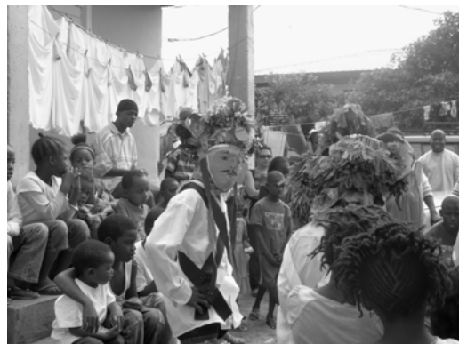
Grants 2009. Celebrating Creole and Garinagu culture through the collection of oral ancient myths of Placencia Village and Seine Bight Village, Stann Creek, Belize.

Dominican Institute of Comprehensive Development- IDDI , technical training for the artisans of Bayahíbe, Puerto Plata, Central Cibao and Santo Domingo