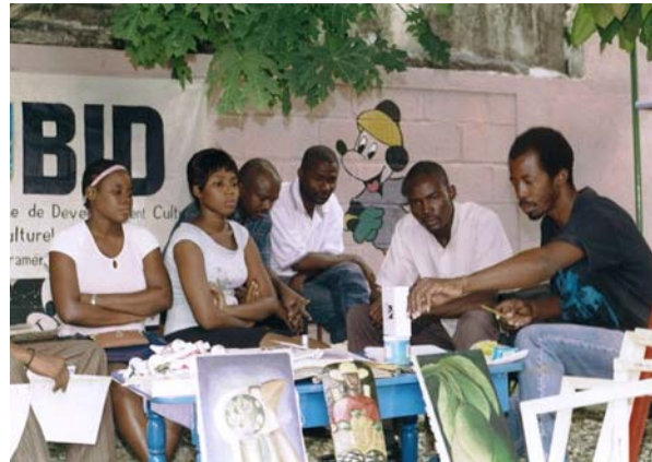
Grants 2009. Painting and crafts workshop for 50 young artists in the Carrefour-feuilles region of Haiti.

concert by a brass quintet of young musicians educated by the Red de Escuelas de Música de Medellin, a city program operated by the University of Antioquia, and financed in part by the IDB.