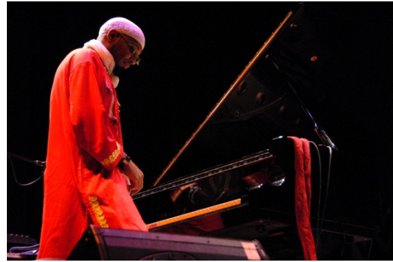
Jazz pianist Omar Sosa takes the stage

Feb 26 Grupo Bahía , a musical ensemble from the Colombian Pacific coast that blends the traditional folkloric sounds of instruments such as the marimba de chonta, cununos and taboras with those of Western instruments like the saxophone, was introduced by the Colombian Minister of Culture, Ms. Paula Moreno, in honor of Black History Month and the Route of the Marimba preservation project. The concert was co-sponsored by the Embassy of Colombia , the Ministry of Culture of Colombia, and the Smithsonian National Museum of African American History and Culture.