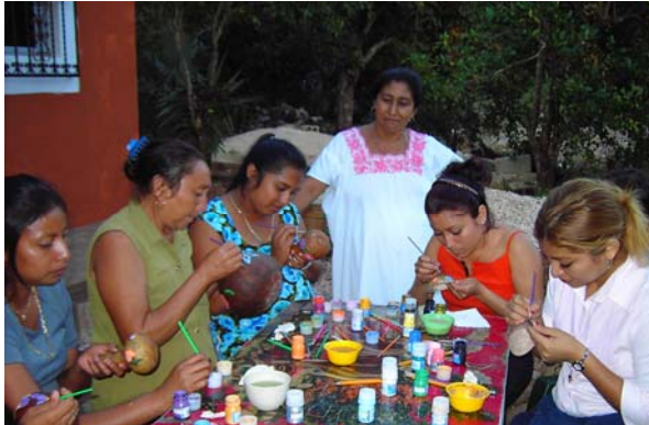
Grants 2009. Indigenous crafts workshop using local raw materials in the Yucatan rural communities of Xpotoit, Kankab and Tekax, Mexico.

Parakultural Art and Science, Casa Vieja Project: urban development awareness campaign to improve basic living conditions through a coalition of artists in downtown Lima; Peruvian Amazon Research Institute-IIAP , training in the production of natural crafts for the communities of the wildlife corridor of Nanay-Pucacuro in Loreto