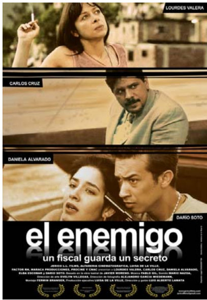
El Enemigo (The Enemy), Venezuela 2008, had its DC premiere at the IDB Cultural Center.