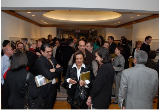
The opening ceremony of the exhibition “Medellin: Art and Development” at the Cultural Center’s art gallery.