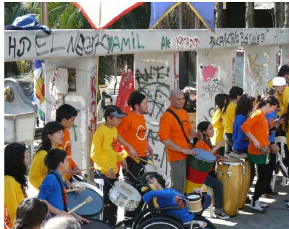
Grants 2009. Murga Theater organizes a percussion festival for youth in Buenos Aires, Argentina.

reviews, 600 listings, 25 TV spots, 15 radio interviews, 4,000 hits in several YouTube videos and 15 guided tours of the art gallery.