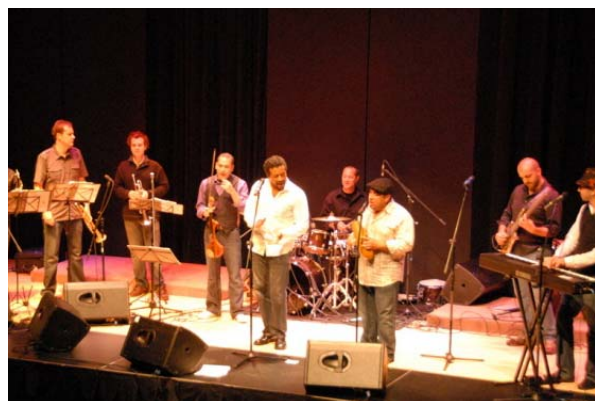
Grupo Bahía from Colombia, celebrating Black History Month.

7 embassy collaborations included the embassies of Belize, Croatia, Colombia, Israel, Venezuela, Peru, and the Mexican Cultural Institute. 4 events were held in honor of the Annual Meeting in Medellin, Colombia; and 16 IDB member countries were represented this year: Chile, Colombia, Argentina, Ecuador, Bolivia, Peru, Israel, Brazil, Canada, Venezuela, Korea, Guatemala, Mexico, USA, Croatia, and Belize. Though Cuba is not currently a member of the Inter-American system, 3 events featured artists of Cuban heritage.