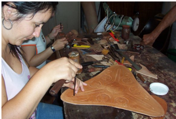
Grants 2009. Leather tooling workshop in Corrientes, Argentina, to revive former levels of leather production.

Corrientes; Barracas Cultural Circuit , social inclusion through the artistic discipline of Murga Teatro in Buenos Aires