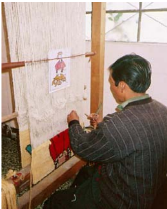
Weaving classes in Guatemala to encourage trade.

Traditions of the Andean high plateaus in the Rangel Municipality of Merida - El Convite Rural Center Civil Association .