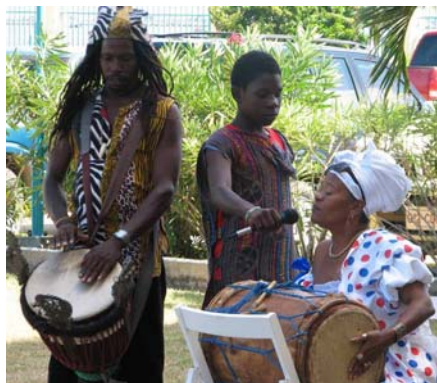
Traditional Kriol dances and musical training for trainers by National Kriol Council, Belize