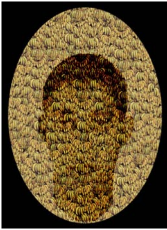
Brother and Plátanos (Hermano y plátanos) , 2005 by Julio Valdez (b. 1969, Santo Domingo, Dominican Republic - ), archival pigment print on paper; 22 x 30 inches.