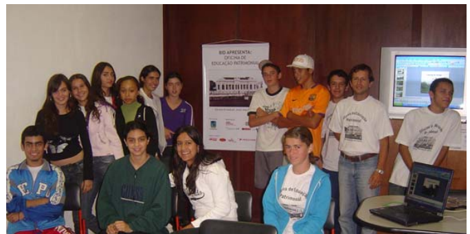
Establishment of Cultural Patrimony Education Office at Sao Joao del Rei Regional Museum in Minas Gerais, Brazil.

Competitive wool craft training for artisans of Momostenango - Gabina Foundation