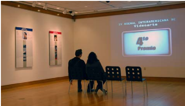
The Art Gallery of the IDB Cultural Center showing "IV Inter-American Biennial of Video Art"

Jan to Dec. III Inter-American Biennial of Video Art. The 3rd edition of the Biennial circulated among twenty institutions in the Region, including Argentina, Colombia, Ecuador, Panama, and Honduras.