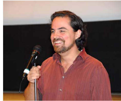
Film director Alex Rivera introduces his award-winning sci-fi thriller, Sleep Dealer , at the opening of the XIX Washington Latin American Film Festival at the IDB in September.

As part of the 49th Annual Meeting of Governors of the IDB, the Center organized two exhibitions: the first, held at Headquarters and entitled Extended Boundary , was dedicated to the development of the City of Miami and the role it has played in the last decades as a place where the Region and the United States merge; the exhibition attracted more than 2,000 visitors. The second exhibit, entitled Beyond Borders , was set up at Miami's Freedom Tower; this one was organized with artworks from the IDB Art Collection, in cooperation with Miami Dade College, which is the largest in the United States boasting a population of 150,000 students, 75% of whom are related to the Bank's member countries; this exhibit received more than 15,000 visitors. Also related to Miami, the Center presented several lectures and a concert at Headquarters, among them Miami Herald architecture critic Beth Dunlop, poet and art critic Ricardo Pau-Llosa, and salsa band leader José Conde and Ola Fresca.