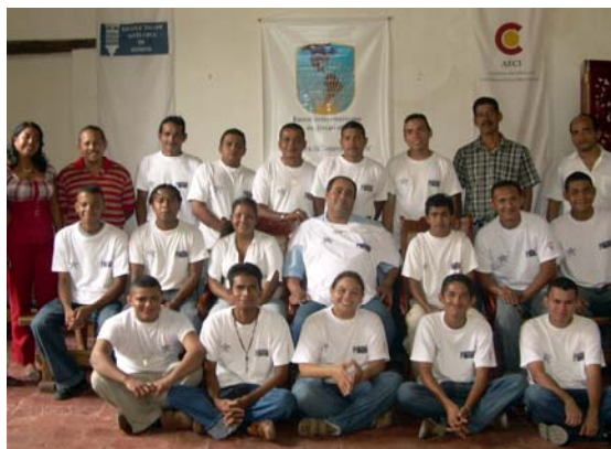
Youth training in metal work and design to help restore the old town center in Santa Cruz de Mompox, Colombia.

Preservation of the cultural heritage of the Arowak indigenous people of the Amerindian villages of Powakka in the District of Para, Hor' Yu Culturú Na Yu Gudu - Foundation for Socio-Economic and Sustainable Human Development