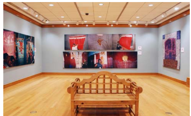
View of the IDB Cultural Center exhibition "Inside and Out: Recent Trends in the Arts of the Dominican Republic."