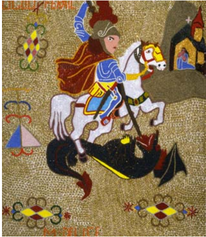
Ogou Ferail , 2004 by Mireille Délice (b. Port-au-Prince, Haiti, 1970 - ) applique and embroidery on fabric; 30 x 26 inches. Permanent loan from the Inter-American Culture and Development Foundation, Washington, DC.