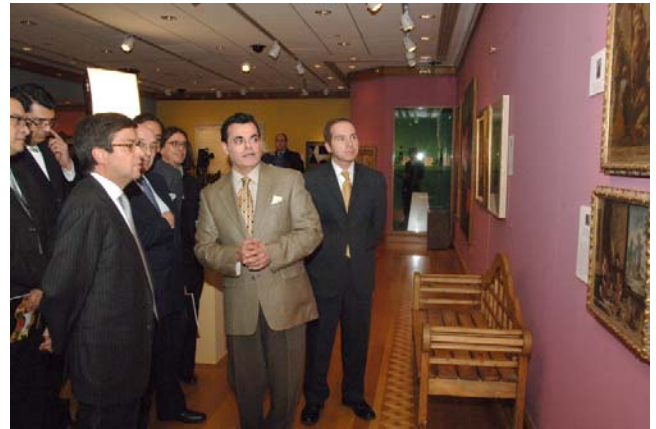
IDB President Luis Alberto Moreno (left) at the opening in January 2008 of the exhibit, "Artful Diplomacy: Art as Latin America's Ambassador in Washington, D.C."

Synopsis: Through a combination of historic, artistic, ethnographic, anthropologic, and documentary approaches, the Exhibition Program calls attention to specific situations related to the development process of the member countries, and illustrates the contributions made to culture by outstanding members of the Inter-American community. The Exhibit Program is carried out at the Center's gallery at Headquarters, and usually features four exhibits a year. The Exhibit Program also cooperates with other offices of the IDB, organizations in Washington, DC, and more in the Region.