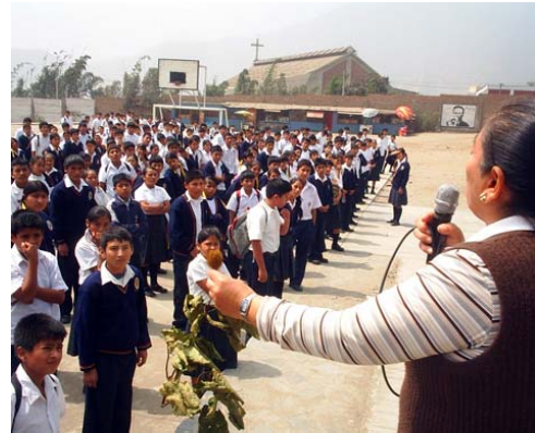
Protection of the Puruchuco and Huaycan archaeological sites through the teaching of Inca traditions to adjacent schools in Ate and Vitarte, Lima.

In alignment with the main mission of the IDB, and with the help of the Country Offices, the Cultural Center disbursed US$240,000 in the 26 countries of the Region, co financing 45 micro-cultural projects out of a total of 783 proposals presented during 2008. Projects were implemented with direct assistance from both the Cultural Center and the Country Offices.