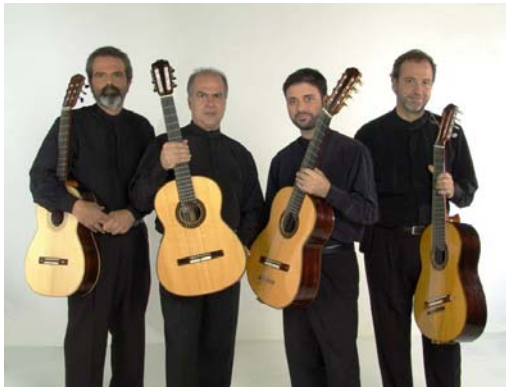
The Brazilian Guitar Quartet launched the 2008 Inter-American Concert Series at the IDB Cultural Center on January 11, 2008.

May 12 Chilean folk duo Eduardo Peralta , on guitar, and singer Cecilia Echenique (thirteen albums) offered an evening of songs by Peralta, Juan Manuel Serrat, Violeta Parra, Victor Jara, and Silvio Rodríguez, among many others. The concert was presented in partnership with the Organization of American States.