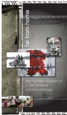
Cover of the catalogue of "Far from Home. The migration Experience in Latin America and the Caribbean."