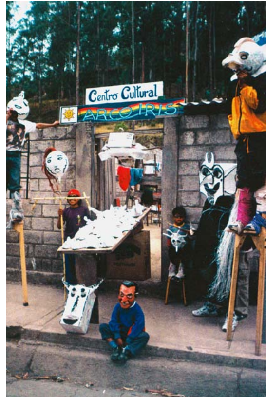
In Ecuador the Cultural Center's CPF-2000 helped CIDECA create Otavalo's Community Cultural Center where dance, theater, ceramic and traditional mask workshops were implemented. The photo shows the final products prepared by members of the community in a mask workshop. The sale of those objects will contribute to the sustainability of the Center.

system of Montevideo as part of an art and anthropology research project (Uruguay); a project to research and recuperate the traditional Afro-Venezuelan music of the communities of Vargas and Barlovento where certain musical pieces will be reproduced in CDs and a textbook will be published for local schools (Venezuela).