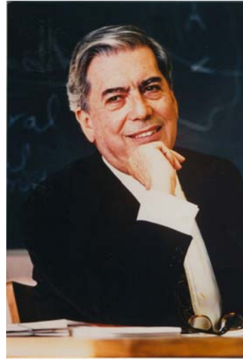
Peruvian writer, Mario Vargas Llosa, discussed the positive and negative aspects of globalization in "Culture and Freedom in a World Without Frontiers" at the IDB's Andrés Bello Auditorium in September, 2000.

The annual publication of the Encuentros pamphlet series of outstanding Cultural Center lectures included five new issues from the 1999 speakers, and seven previous editions were translated to English or Spanish. The 2000 distribution of 5,000 pamphlets reached over 600 libraries in the member countries.