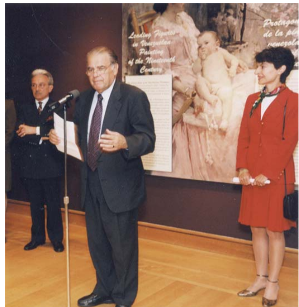
IDB President Enrique V. Iglesias formally inaugurates the exhibition Leading Figures in Venezuelan Painting of the Nineteenth Century in the Cultural Center Art Gallery.

In addition to an exhibition featuring 49 outstanding works from the IDB Art Collection , in 1999 the entire collection (1,520 works) was physically inventoried, and 500 of the most valuable and historically significant works were professionally appraised.