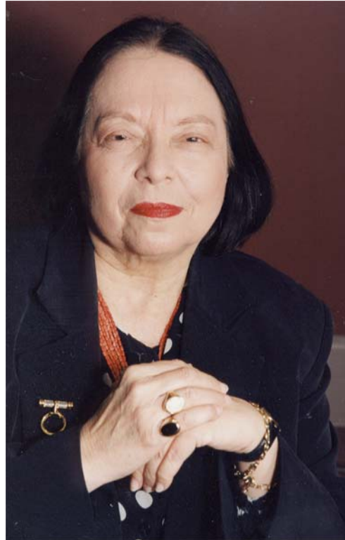
Brazilian writer, Nélida Piñon, presented a lecture on the "AFemale Memory in Literature."

During 1999 the Cultural Center completed the translation of the first twenty lectures that comprise the Encuentros pamphlet series of outstanding lectures, and added eight new lectures to the series. Over 12,000 of these new and recently translated editions were distributed, free of charge, to over 500 university and municipal libraries and academic centers in the member countries.