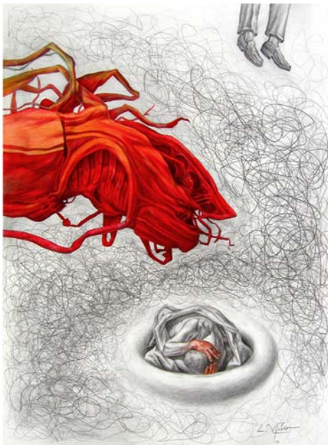
Vértigo (Vertigo) , 2004 by Limber Vilorio (b. 1972, Santo Domingo, Dominican Republic-) mixed media on paper; 23.6 x 29 inches