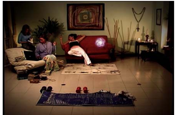
C.A.E. Cuerpo, alma y espíritu (Body, Soul and Spirit) , 2005 by Mónica Ferreras (b. 1965, Santo Domingo, Dominican Republic-) Video: DVCam; 6:30 minutes