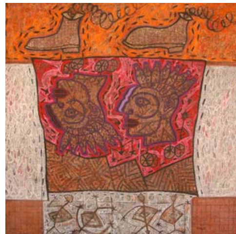
Cabezas llenas de plátanos (Heads Full of Plantains) , 2008 by Radhamés Mejía (b. 1960, Santo Domingo, Dominican Republic-) mixed media on canvas; 70.9 x 70.9 inches