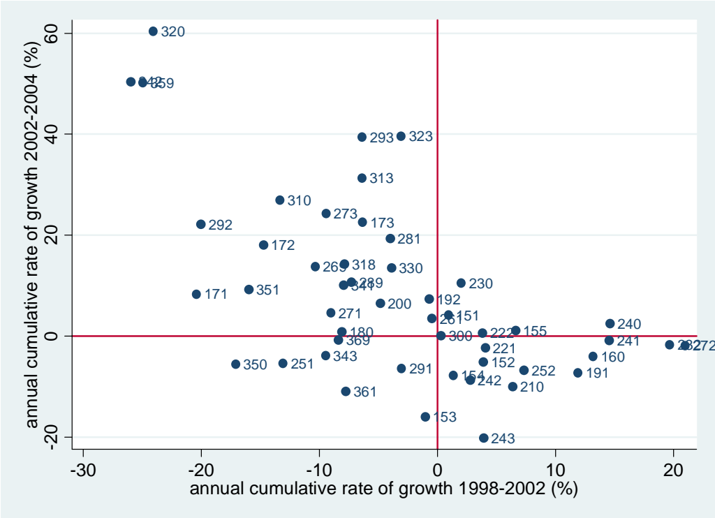
Figure 2. Evolution of Shares in Total Manufacturing of All 3-Digit Sectors

As a result of these changes, the sectoral structure between peak years of the Convertibility regime and the new one (1997 vs. 2007) was not dramatically different (Table 3). Some changes nevertheless deserve further attention. First, there was a very important increase in the weight of basic metals in value added, which is mostly explained by the increase in prices. Second, there was a decrease in the share of the oil sector, mainly due to internal price controls which retarded physical growth in this sector in comparison to total manufacturing. Third, technology-intensive sectors such as machinery and the automobile industry gained share in value added. In exports, the structure was quite similar, led by food products, automobile, oil, and chemicals.