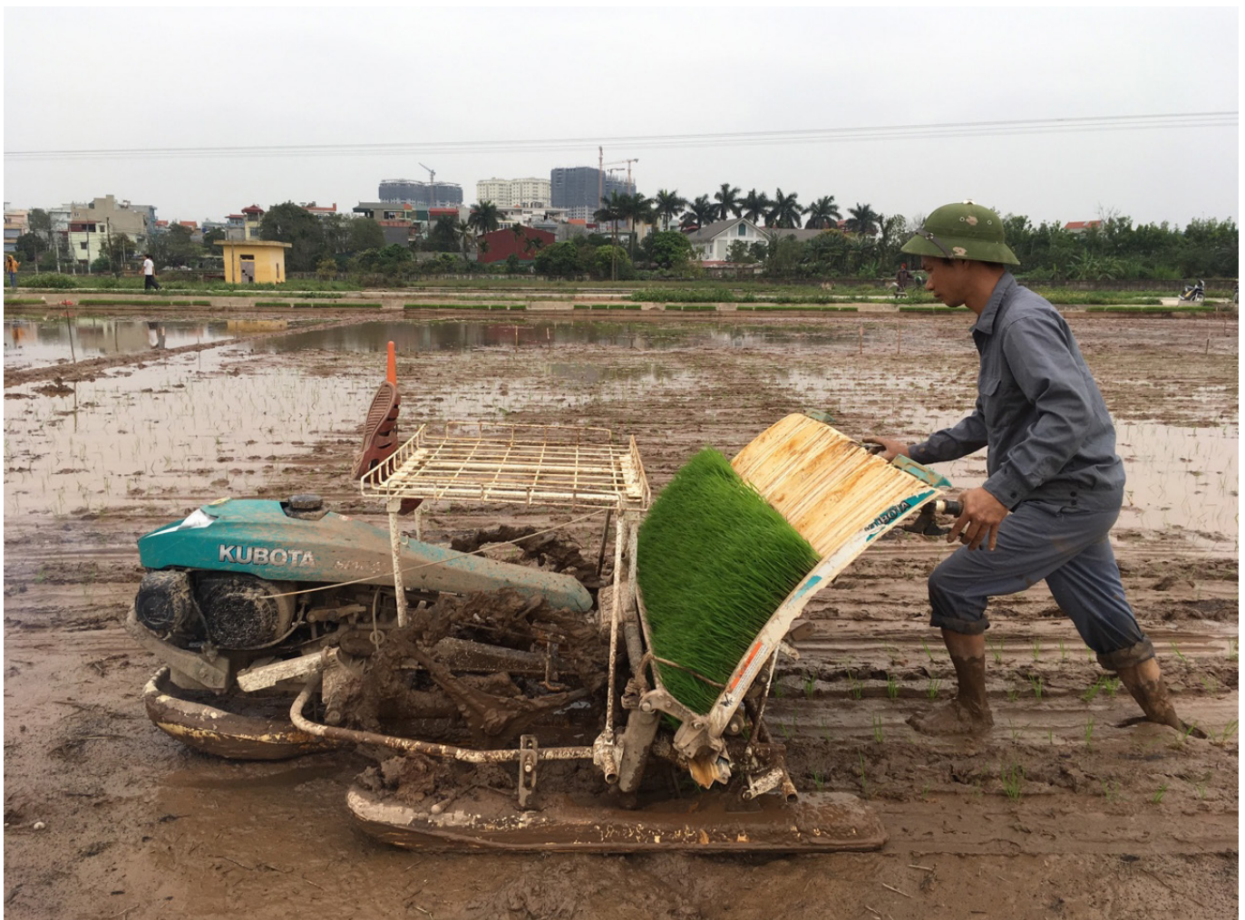
Ta Minh Truong

The use of mechanization in rice production from soil preparation and sowing to transplanting and harvesting has helped effectively exploit labour, time, environmental protection and more efficient input management. Mechanization in rice production has significantly altered farmers' perceptions and farming practices, shifting from a small-scale and unplanned farming approach to large-scale production. After several years of mechanization in rice production, productivity has increased from 10 to 15%, production costs have been reduced, and losses have decreased by 2-3%, while ensuring seasonality and improving the quality of rice.