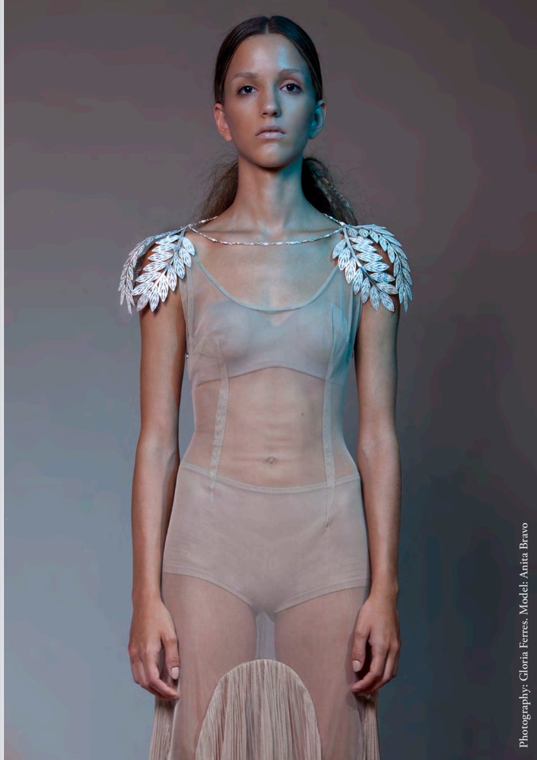
Model: Anita Bravo

Fashion Design Diseño de moda Ta'angahai ñemonde âgagua rehegua