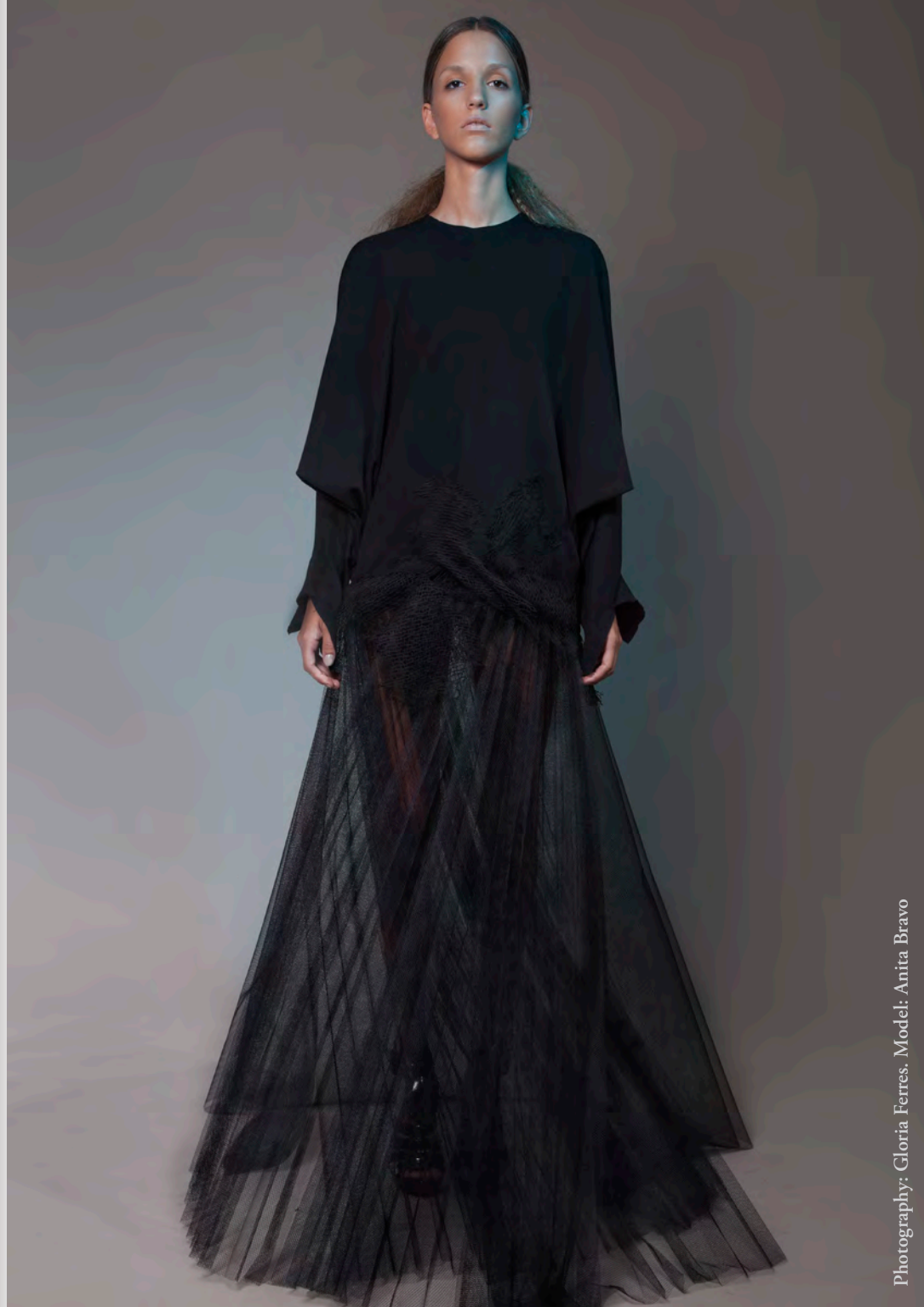
Model: Anita Bravo

Fashion Design Diseño de moda Ta'angahai ñemonde âgagua rehegua