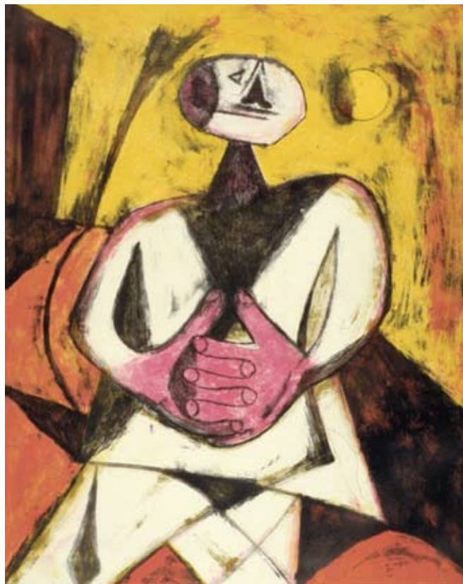
Rufino Tamayo • Man Contemplating the Moon ,

Peruvian painter Fernando de Szyszlo viewed pre-Columbian art as an unpublished language of shapes that speaks to an artist in a language that modern art has already made known to him. In Mar de Lurin , a sense of the rhythms of the sea found in ancient textiles insinuate their way into the intricate composition of this mixograph. The mixograph print, which produces printed relief images using a very thick hand-made pulp for support, is especially suited to an artist whose work is known for rich textural effects. Another example of the mixograph print is Fish by Francisco Toledo , founder of