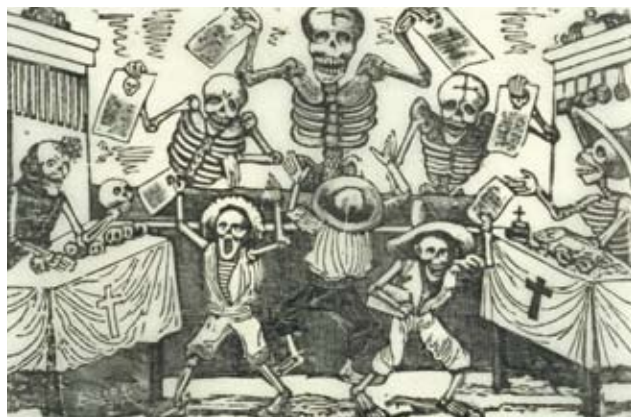
José Guadalupe Posada • Calavera de los Periódicos/Ciclistas (Skull of The Newspapers)

The earliest prints in the collection are those by Mexican José Guadalupe Posada (1852-1913). As a cartoonist for newspapers and pamphlets, Posada produced countless metal engravings on subjects that dealt with crimes, political events, love affairs, superstitions, floods, earthquakes, assassinations, and popular ballads. He pioneered the use of zinc plates as a faster and more practical method than lithography. It is estimated that in his forty year career, Posada produced over 20,000 engravings. His art was a type of caricature full of associations and imagery that had an immediate and