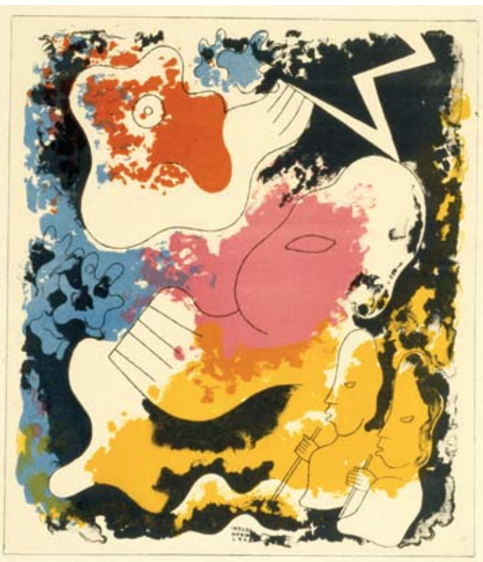
Carlos Mérida • From Estampas del Popol Vuh (Illustrations for the Popol Vuh )

In Latin America the 1960s and 1970s were marked by particular vitality and experimentation in the graphic arts. The flourishing of graphics was encouraged by numerous Latin American graphic arts competitions, such as the Latin American Graphics Biennial of San Juan in Puerto Rico, and by the writings of critics such as Marta Traba who played an important role in recognizing and defining the graphics surge.