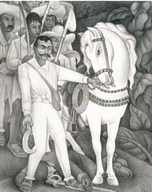
Diego Rivera • Zapata

Mexican muralist David Alfaro Siqueiros consistently voiced his solidarity with workers and the victims of oppression in murals, paintings,