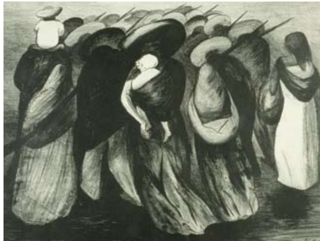
José Clemente Orozco • La Retaguardia (Rear Guard)

The Mexican Taller de Gráfica Popular (TGP) also contributed to wide acceptance of the graphic arts in Latin America. A printmaking workshop, founded in 1937 by artists Leopoldo Méndez, Pablo O'Higgins, and Luis Arenal, the TGP was committed to the direct use of visual art in the service of