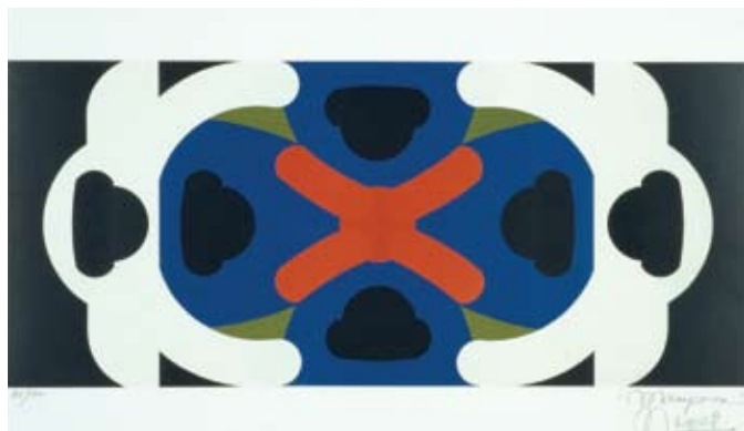
Edgar Negret • Mariposa (Butterfly)

and destructiveness that "Black Gold" represents in Venezuela and society at large.