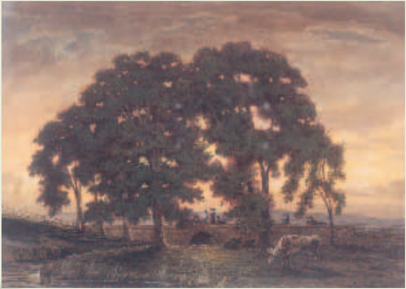
MICHEL JEAN CAZABON Sunset Rural Landscape