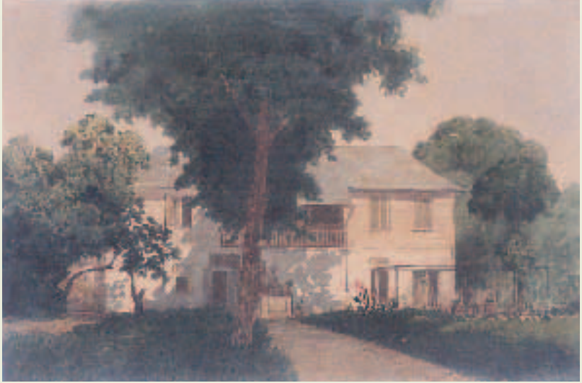
MICHEL JEAN CAZABON Pines House