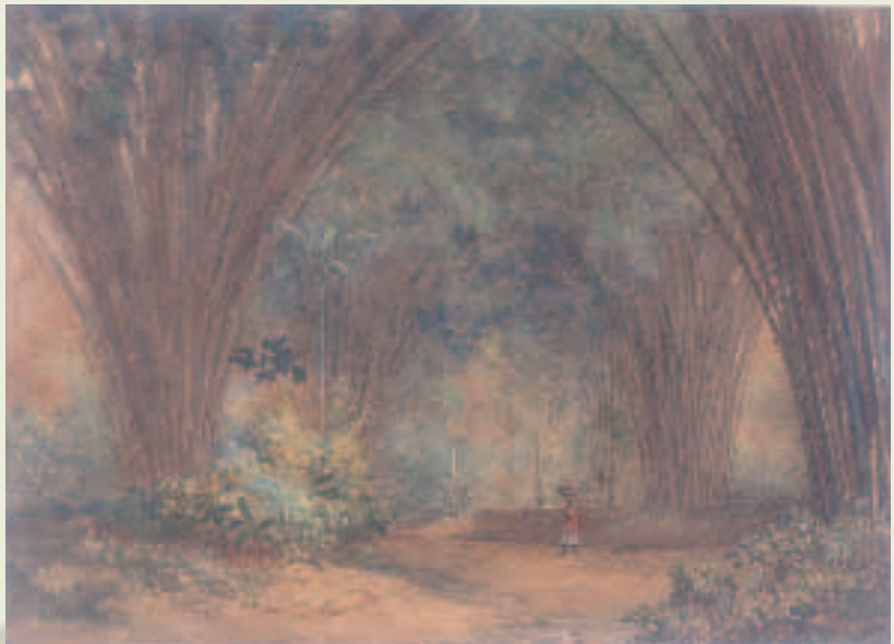
MICHEL JEAN CAZABON River at St. Anns