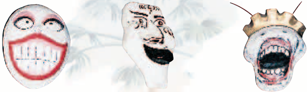
PETER MINSHALL Papier-mâché carnival masks

Despite the great success of Peter Minshall, who has been able to stage his monumental presentations at the Pan-American and Olympic games as well as the São Paulo Biennial, not everyone agrees with the direction that Carnival has taken.