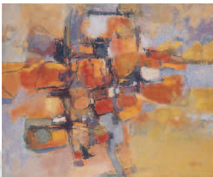
ISAIAH J. BOODHOO A Landscape with Trees