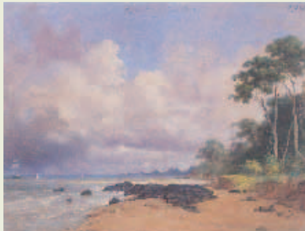
MICHEL JEAN CAZABON Coast of La Brea

One must keep in mind that even for a person of Cazabon's abilities, making a living was not easy. In the colonies, the privileged represented a very small group. After ten years in Martinique, Cazabon returned to Trinidad in 1870 and continued to work until he died in 1888, plagued by economic difficulties. After his death, his work remained known only in the circles of those who employed his services. It has only been over the past ten years, thanks to the ingenuity of marketing, that his legacy has resurfaced as a source of pride of the people of Trinidad and Tobago.