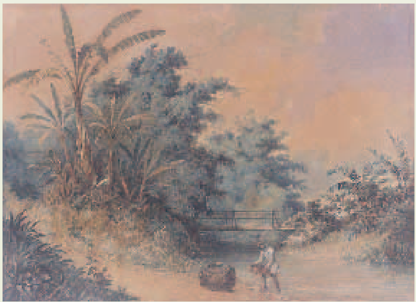
MICHEL JEAN CAZABON River Scene