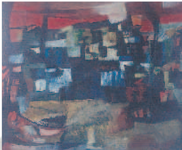
WILLIE CHEN Village Shacks

The current exhibit includes "Family Group," a piece representative of Baney's early work, and a 1998 piece entitled "Standing Female Figure." Taken together, the two works make it possible to appreciate the transformation of Baney's work over the years.