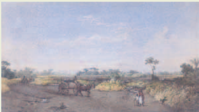
MICHEL JEAN CAZABON Asphalt Lake