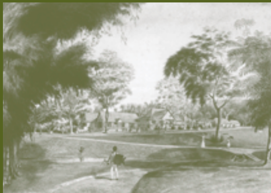
MICHEL JEAN CAZABON The Cottage, St. Anns