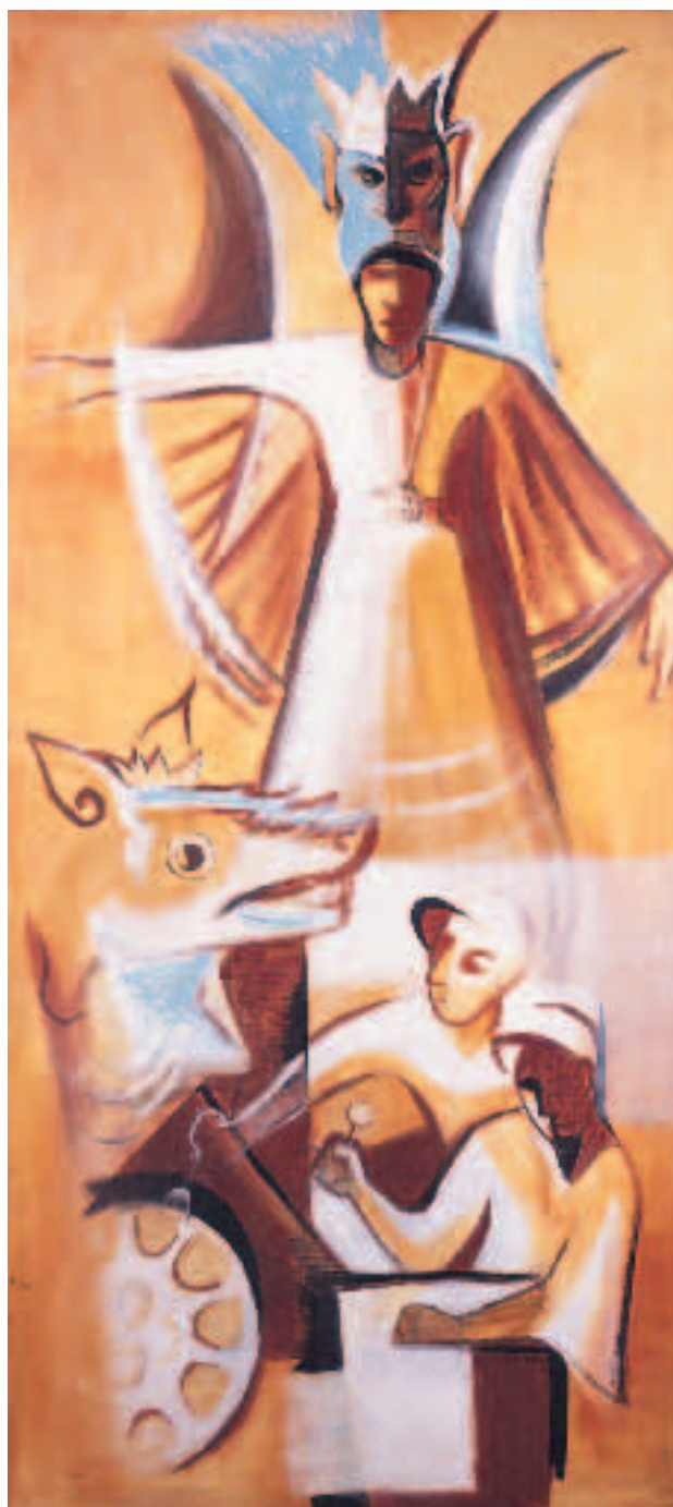
SYBIL ATTECK Spirit of Carnival