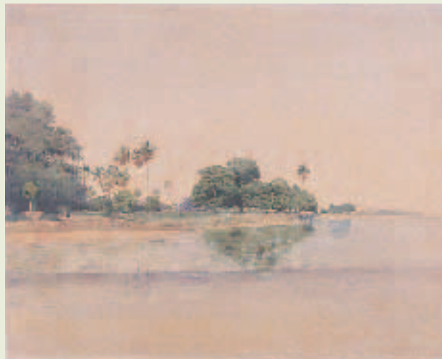
MICHEL JEAN CAZABON Rural View from Sea

The current exhibit features only Cazabon's watercolors, the technique that best illustrates his talent as well as his romantic vision of the ideals of his day. Reality as a subject had begun to be appreciated in relation to nature and anthropologi-