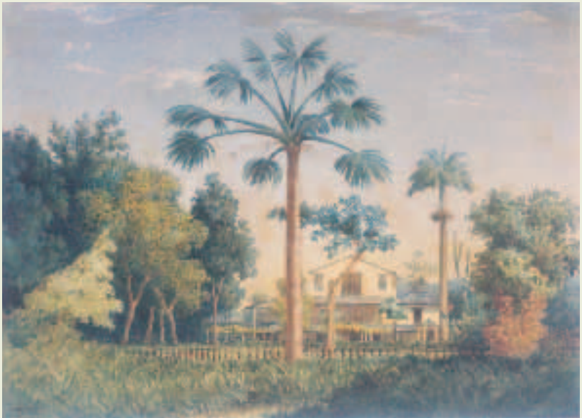
MICHEL JEAN CAZABON House in Trinidad II