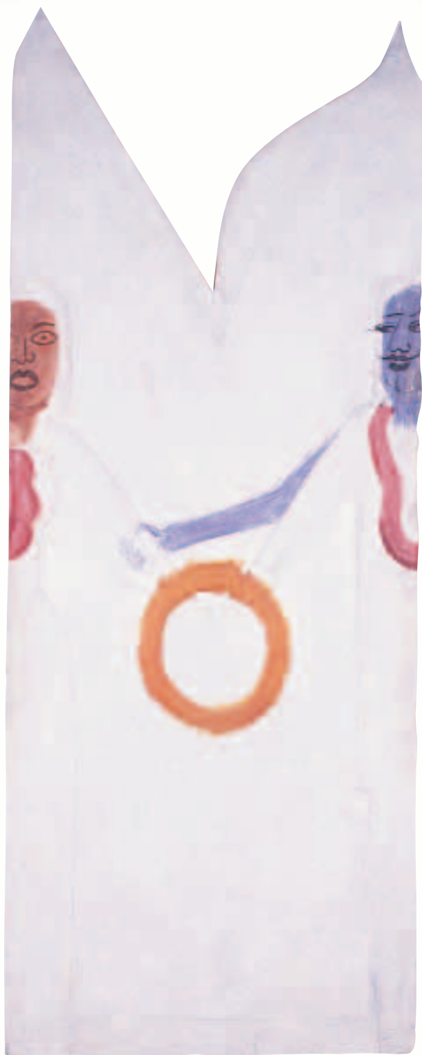
WENDY NANAN Idyllic Marriage