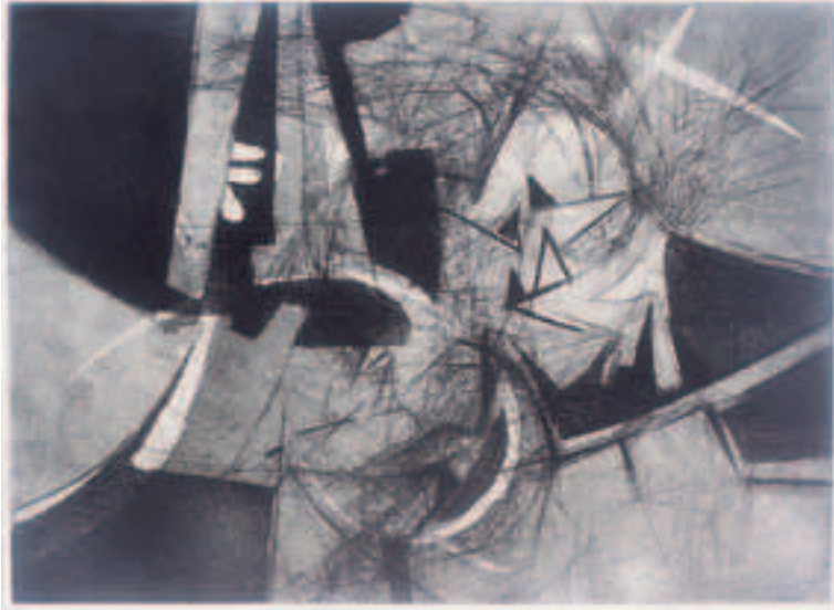
SONNYLAL RAMBISOON Swinging