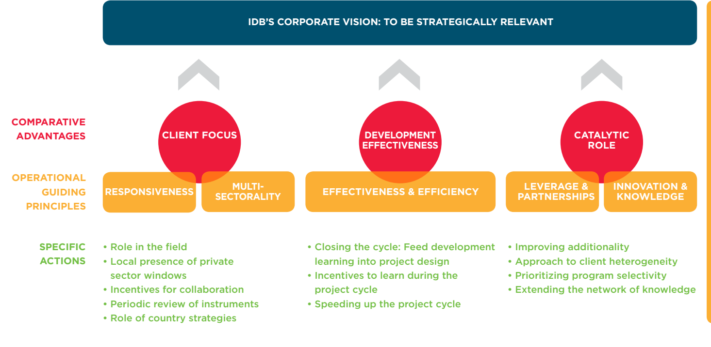
FIGURE 3. IDB's CORPORATE VISION

operational focus of the UIS. With respect to Country Development Results, a key source of information for the majority of indicators will be the Project Monitoring Report system—the information system that tracks the outputs and outcomes of Bank-financed SG operations. After the UIS is approved, the complete CRF proposal (including targets for relevant indicators) will be finalized and presented to the Board of Executive Directors for its consideration and eventual approval in 2015, so that the Bank can begin to monitor the UIS in January 2016.