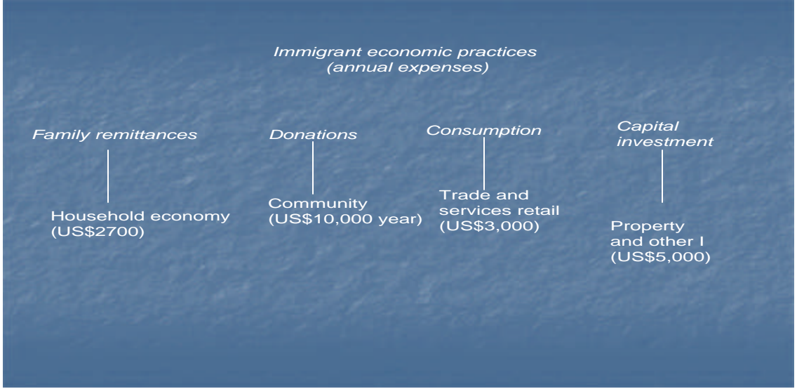
Figure 2: Immigrant economic practices

These links have contributed to shaping a transnational identity that defines their place as diasporas. Sheffer defines diasporas as a "sociopolitical formation, created as a result of either voluntary or forced migration, whose members regard themselves as of the same ethno-national origin and who permanently reside as minorities in one or several host countries. Members of such entities maintain regular or occasional contacts with what they regard as their homeland and with individuals and groups of the same background residing in other host countries" (Sheffer 2003, 10-11).